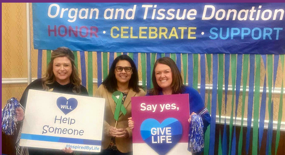
Pictured: Nursing leaders from St. Louis Children's Hospital gather in front of the photo wall at the Inspired by Life Symposium.