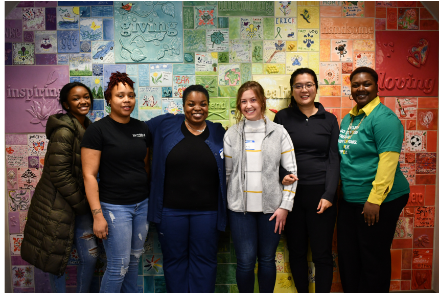
Pictured above: Nursing scholarship recipients from St. Louis Community College gather in front of the Remembrance Wall during a tour of Mid-America Transplant

In addition to these areas, the Foundation is committed to creating awareness of organ and tissue donation. The Foundation provides scholarships to students studying mortuary sciences, nursing and respiratory therapy. This year, we awarded scholarships to support 17 students at Southern Illinois University Carbondale and St. Louis Community College. In 2023, scholarships will be awarded at Cox College, Missouri State University, Southern Illinois University Carbondale, Southeast Missouri State University and St. Louis Community College.