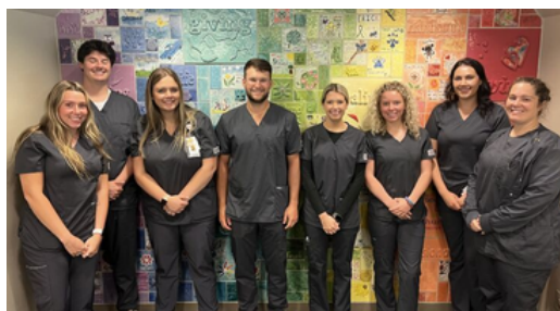
Pictured left: Nursing students from Southern Illinois University Carbondale and St. Louis Community College

The Mid-America Transplant Foundation is committed to the ongoing development of a skilled workforce by supporting students in the fields of nursing and mortuary science, which have critical roles to play in the success of organ and tissue donation. In 2023, 22 students from 3 universities received grants and scholarships from the Foundation.