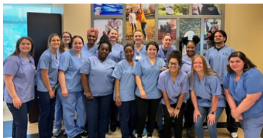
Bottom row: Scholarship recipients and educators from Missouri State University and Southern Illinois University Carbondale. The students visited for a presentation, site tour, and lunch with clinical leaders.